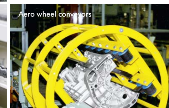
Aero wheel conveyors